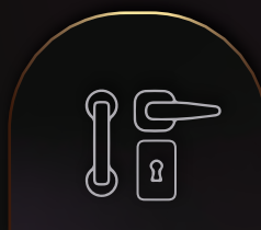
Anodized Aluminium Window + Quality Fittings