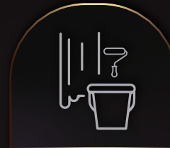
Acrylic Base Exterior Painting