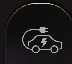
EV Charging Point