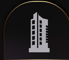
RCC Framed Structure