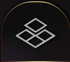
Vitrified Nano Tech Flooring