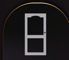
Premium Laminated Doors