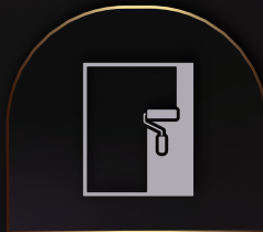
POP On Wall With Luxurious Paint