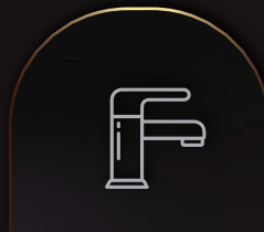
Reputed Tiles + C.P / Sanitary Fittings