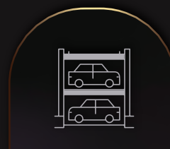
Ample Car Parking+ Mechanical Parking Tower