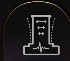
Seismic Force Resistance