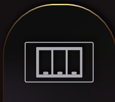
Concealed Copper Wiring + Reputed Switches