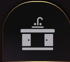
Granite Platform + S.S Sink